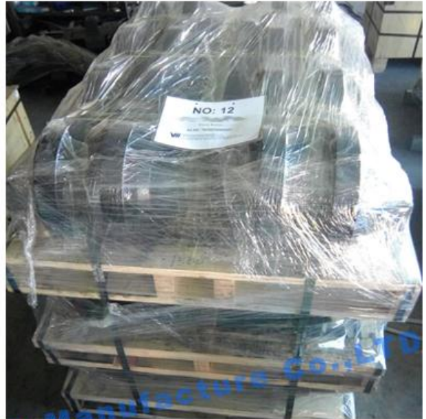
Each Pallet Covered With Thin Film and Sticker