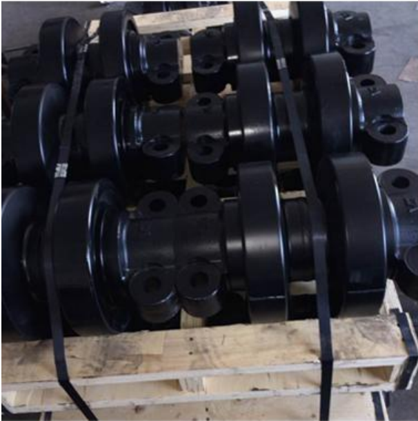
20pcs or 22pcs Track Shoes Each Pallet