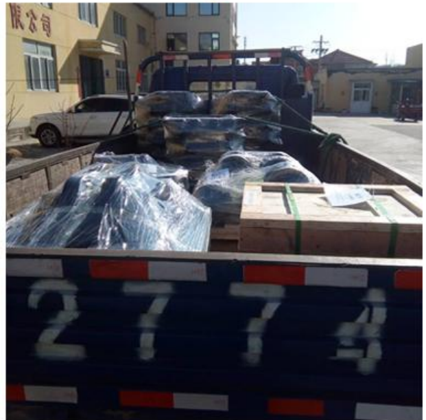
Parts are delivered to Port