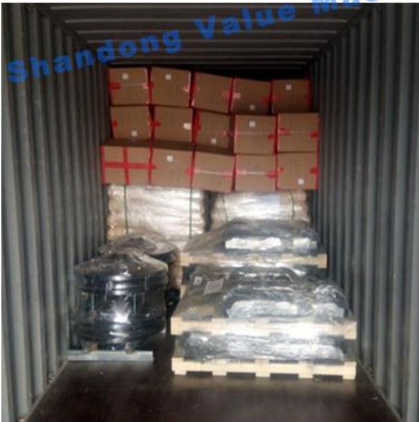
Parts in the Container